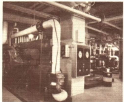
This heat pump, a part of the new installation, has the capacity to run 300 tons of refrigeration. It is one of two heat pumps which heat and cool the Commonwealth Building. When both pumps are running, the system can handle 700 tons of refrigeration.

During all normal heating weather a supply of by-product heat is available from cooling. Had steam been used for heating, this by-product would have been wasted. The heat pump made its utilization possible. Further,